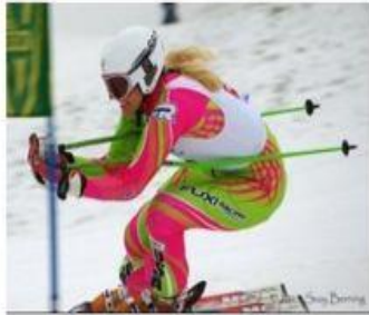
HAVING A BLAST!

If you want to race or ever thought about racing, now is the time to join the LSSC Race Team!